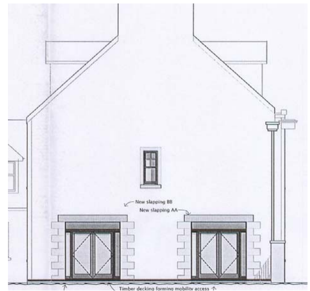
Fig. 4: Treatment of side elevation as currently proposed