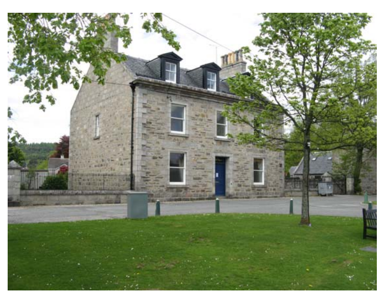
Fig. 2 - Morlich House

1. This report will deal with two related applications at Morlich House, in The Square, in Grantown on Spey. Full plannina permission is being sought in the first application (08/185/CP refers), while the second application is for Listed Building Consent (08/186/CP refers). The formal description of the proposal refers to the carrying out of various internal and external alterations to the existing building, the formation of hard standing, the installation of an oil tank and a mounted sign. Morlich House is a Category C(s)<sup>1</sup> listed building and is a detached two and a half storey stone built property, located in a prominent position in the north western area of The Square. The building dates from 1851, when it was built as a bank. Records indicate that there were various additions to the building in 1869 and 1892. In more recent times, the property has accommodated multiple uses, including a dentists practise in the ground floor, while the two upper floors were used as office space by the CNPA. The property has been vacant since its purchase by the applicants earlier this year. Morlich House is located adjacent to the public road and is surrounded at either side and to the rear by the garden area. The frontage of the site presents a symmetrical appearance, with the actual structure centrally positioned in the plot and demarcated from the public road by a low wall and railings. A one and a half storey extension exists to the rear of the structure.