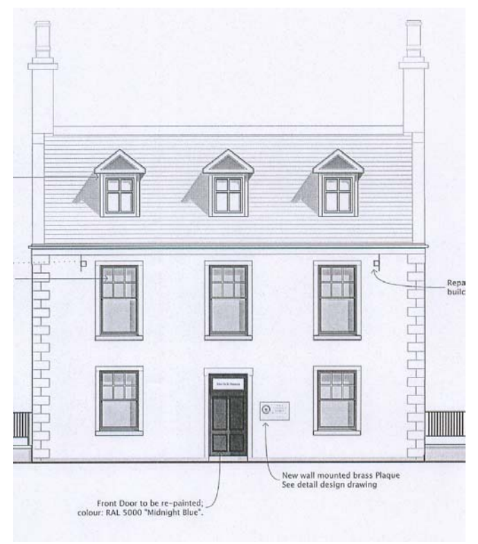
Fig. 6: Proposed brass plaque on the front elevation

10. The second element of the proposal is the formation of hardstanding in the south western (rear) area of the site. Vehicular access is to be taken from the existing entrance on the southern side of the site and would lead to six car parking spaces. The access driveway is proposed to have a new sub base and would be tarred, while the six car parking bays would have a compacted sub-base and a dressed gravel surface finish. The parking bays would be marked in granite setts. Further hard surfacing in the vicinity of the property includes the aforementioned timber deck which would provide access into the new entrance doors in the southern gable elevation. The larch timber decked area would be approximately 2 metres wide and would extend along the length of the building. Landscape proposals include levelling and reinstating the adjacent lawn area and it is also proposed to plant red hawthorn trees inside the front boundary walls (three at either side of the main structure). The trees would be encased in decorative protective railings.