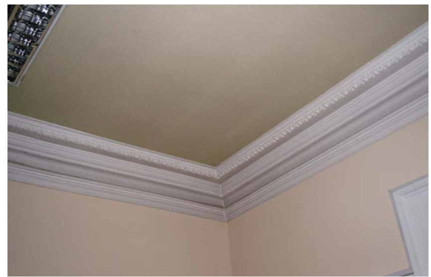
Fig. 5: example of ornate cornicing in a first floor room

8. There are four large rooms on the second (attic) floor of the property, as well as one smaller room which is centrally between the two large front rooms. Similar to the proposed layout of the first floor, internal walls between the three rooms at the front of the building are to be removed to create one large space which would be utilised as a training area. Access to this area would be off the landing via a set of double timber glazed doors. Further sets of double doors would lead from the training area to each of the rear rooms, one of which is to serve as the CEO's office, while the other would be the finance office.